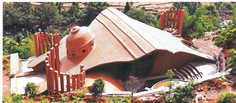
Moonlight Farmhouse Project in Ratnagiri