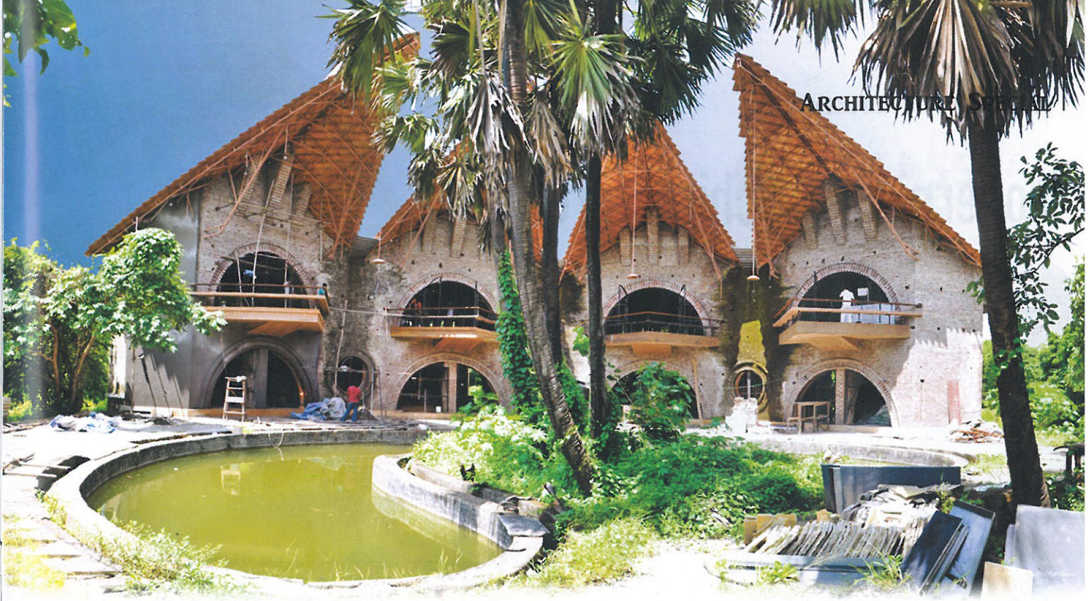
Wildecho Private Hotel in Alibag

the initial stages I felt the profession of architecture to be very boring. In the midst of frustration, a book written by architect Frank Lloyd Wright acted as a relief and a sort of retreat from the regular course of architecture.